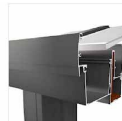
Type 4 - Enhanced

Our most contemporary veranda, this system boasts slimmer aesthetic lines. A perfect example of form embracing function.