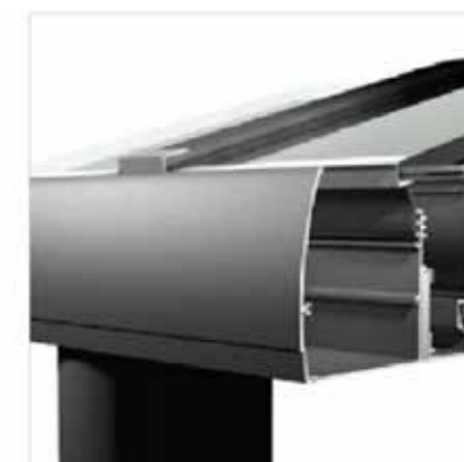
Type 3 - Modern

Incorporates thermal breaks, giving you the freedom to transform the veranda into an insulated living space.